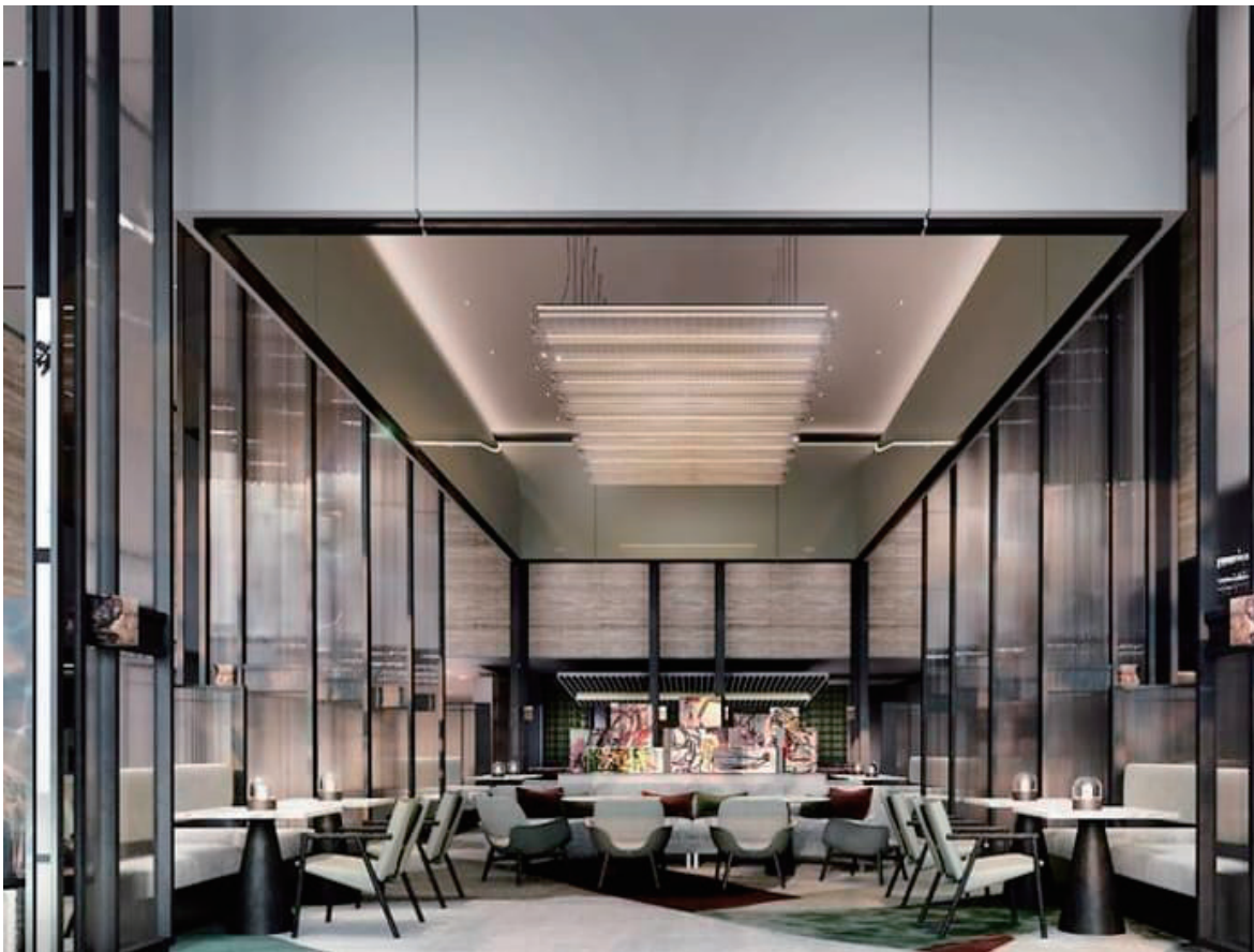
The hotel will feature a total of five dining concepts.

As for dining, Mandarin Orchard's current Chatterbox restaurant and two Michelin-starred Shisen Hanten will be retained. Hilton Singapore Orchard will also debut three new F&B offerings featuring an all-day dining, a specialty restaurant and a lobby lounge and bar.