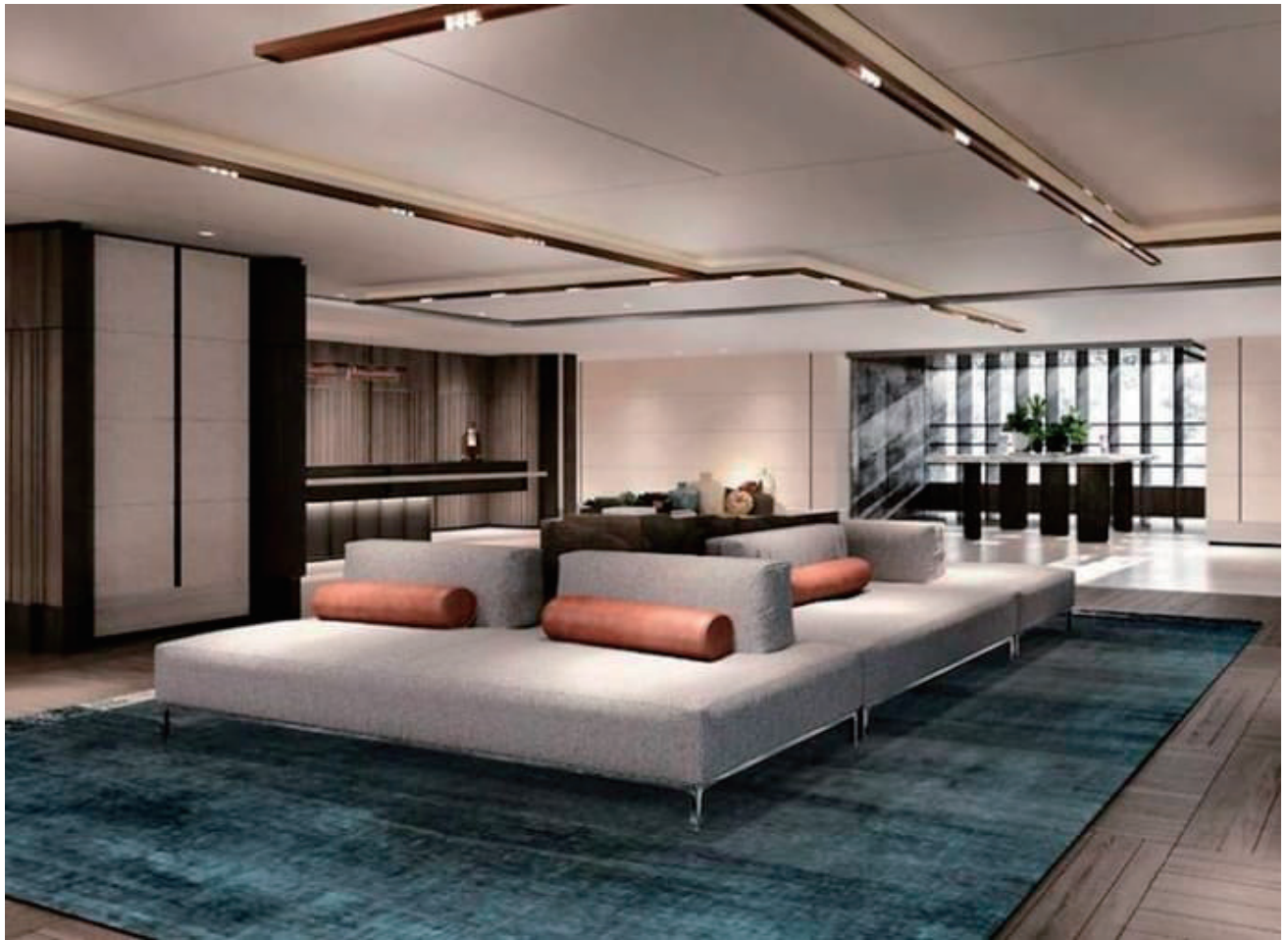
Hilton's new hotel in Singapore is set to become the brand's flagship property in the Asia-Pacific.