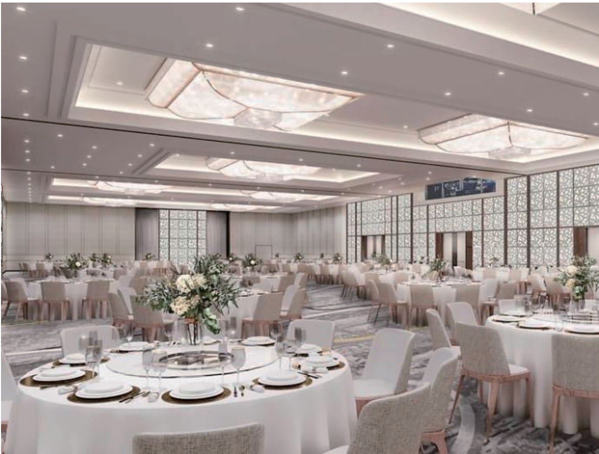
Event spaces include two unique pillarless ballrooms.

The hotel will also feature two unique pillarless ballrooms fitted with state-of-the-art LED walls, lighting and sound technologies that can cater to around 1,000 guests.