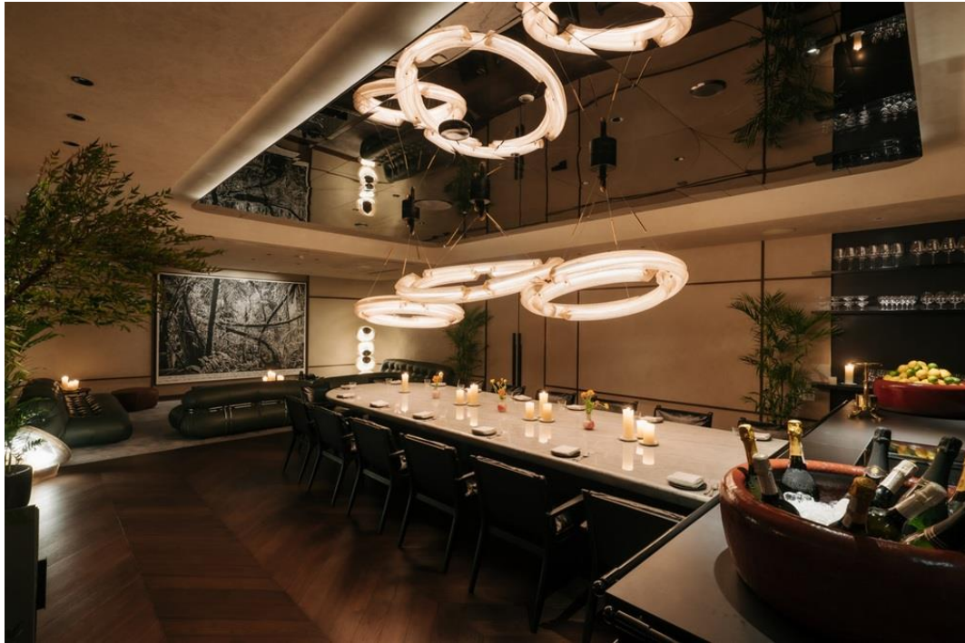
Le Pristine Singapore

Le Pristine Singapore is a dining destination that redefines tasteful and culinary artistry. Designed by Michelin-starred chef Sergio Herman, the restaurant presents a sophisticated atmosphere, enriched by expertly crafted lighting that sets the mood. The striking red-lit entrance to the multi-sensory artistic interiors fascinate the guests to an unforgettable discovery of culinary masterpieces unfolding in their very eyes.