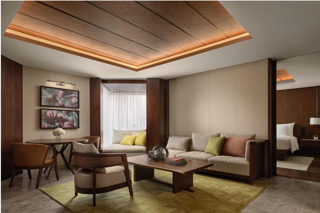
Terrace Wing Guestrooms

Grand Hyatt Singapore's freshly transformed rooms and suites offer a sanctuary of modern elegance. With luxurious textures, warm lighting, and thoughtfully curated furnishings, each space speaks of style and comfort.