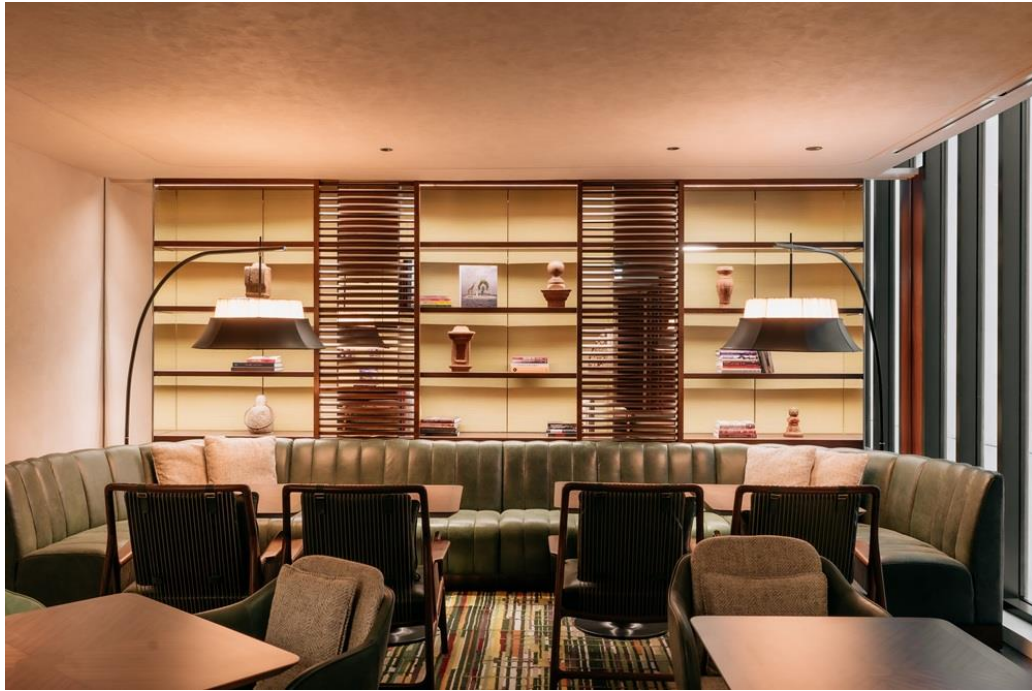
Grand Club

At The Grand Club, lighting is more than just an illumination—it's an art of ambience. The welcoming warm glow defines the soft ambient tone that sets the mood which offers a seamless flow of cozy elegance.