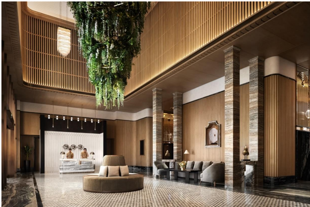
Ground Floor Lobby

Shangri-La Phnom Penh embodies refined luxury, blending Cambodian culture with world-class hospitality. Thoughtfully designed by Avalon Collective and Socialight, the Ground Floor Lobby features warm, elegant lighting that enhances intricate décor, creating a sophisticated yet welcoming ambience.