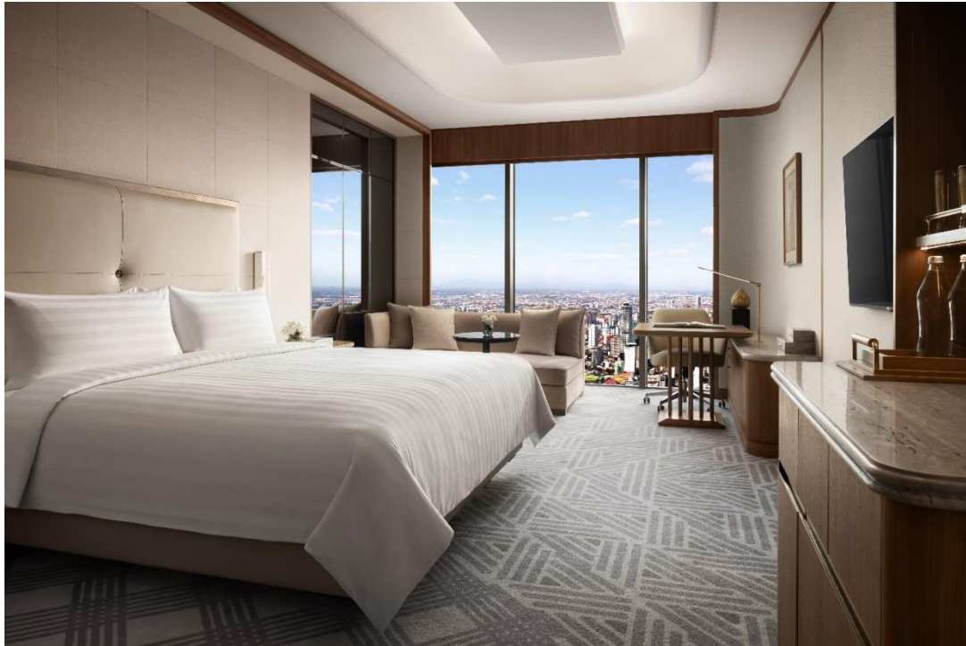
Deluxe King City View Room

The lighting design at Shangri-La Phnom Penh blends grandeur with tranquillity, complementing the entire guest experience. Thoughtfully curated lighting accents highlight architectural features, creating a tranquil ambience that transports the guests to an unforgettable restful stay.