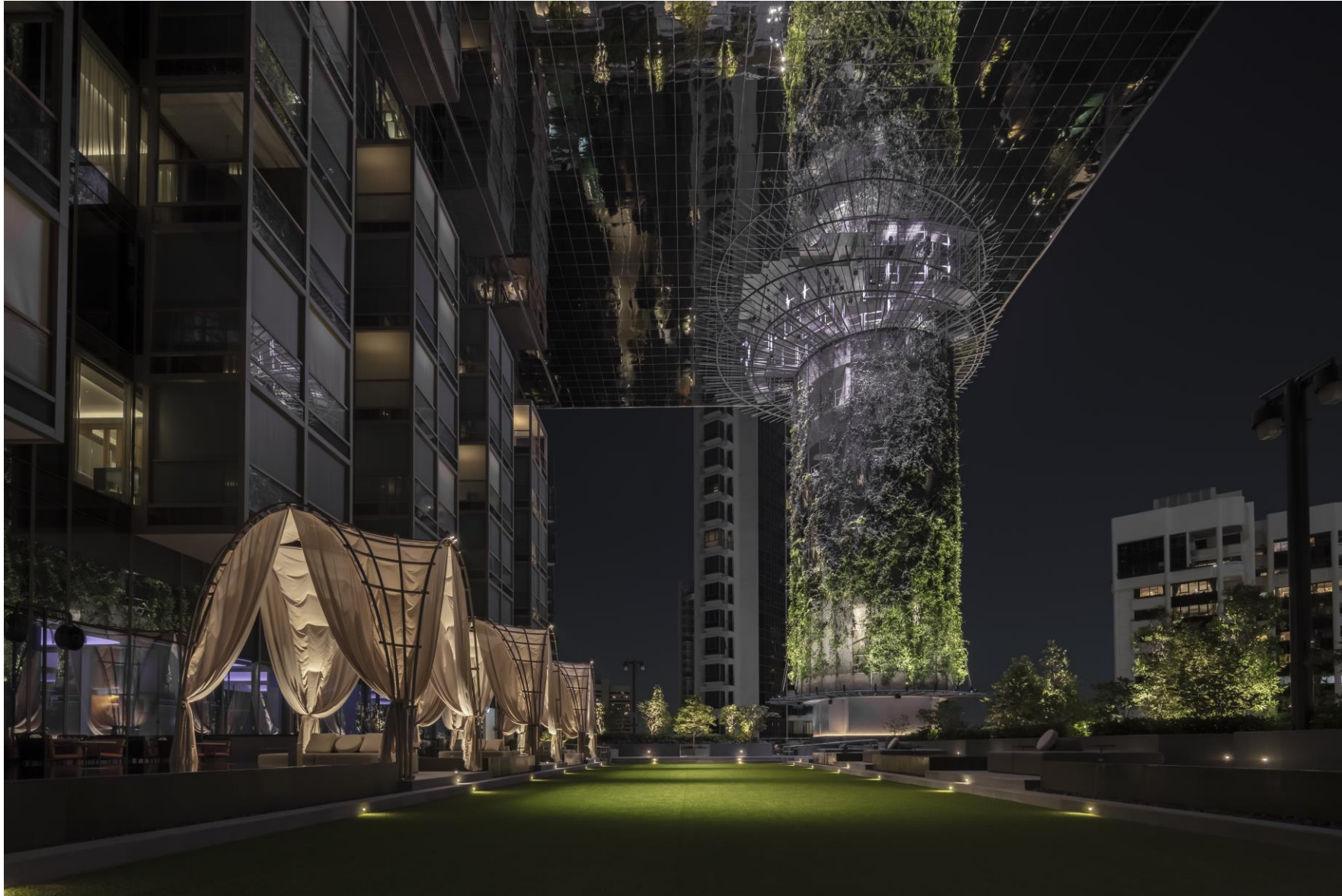
Each of the four terraces is exquisitely landscaped and visually linked through substantial green columns positioned at each corner, adorned with creeping plants destined to flourish even more luxuriantly with the passage of time.