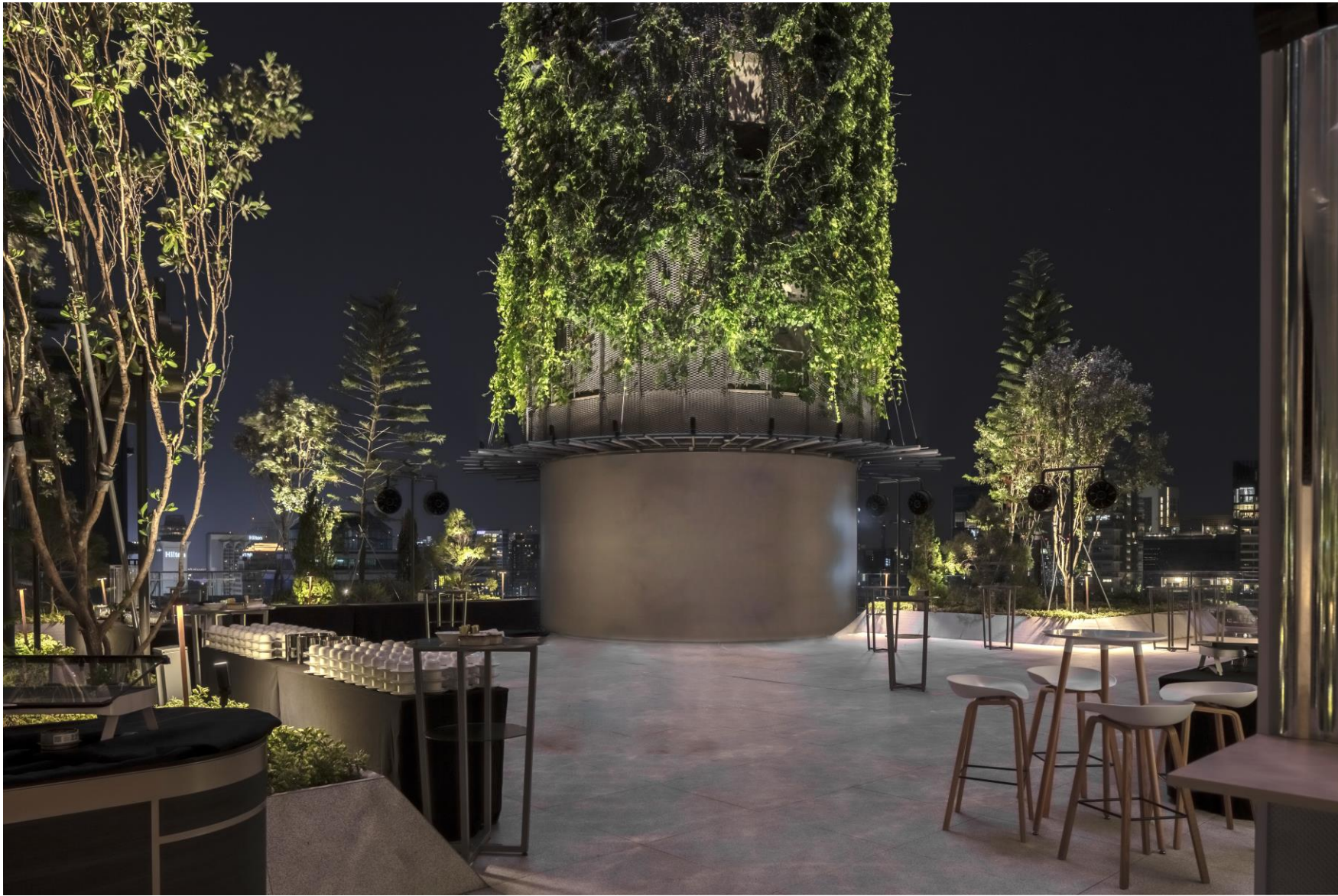
The architecture of the building is divided into four stacks with four open-air sky terraces – Forest, Beach, Garden and Cloud. Each sky terrace creates its own unique experiences through different environments.