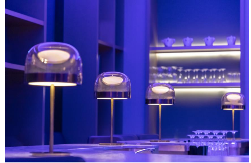
Florette Bar is a luxuriously appointed space, exquisitely designed to embody its namesake, the Roman goddess of flowers.