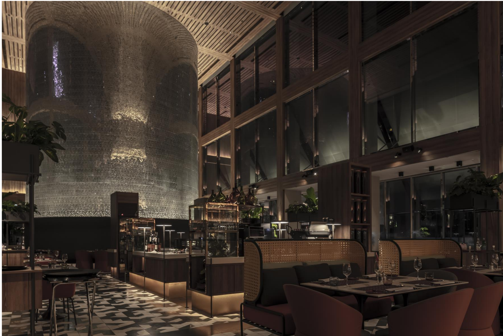
The all-day dining restaurant Mosella, features an open kitchen and a live ceviche station in its interior. At the core of the restaurant, there is a substantial mosaic column, serving as the ideal backdrop for Instagram photos and reels.